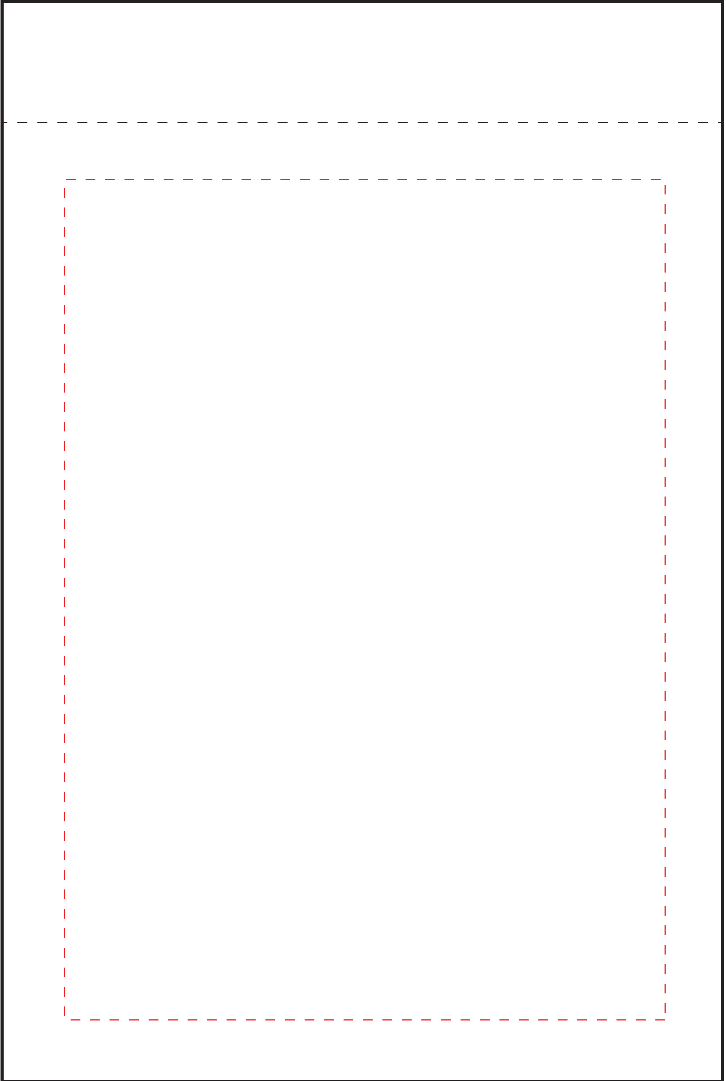
----- Graphic Safe Area