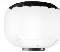
DARKSKY BLD-300-G2 NOT INCLUDED