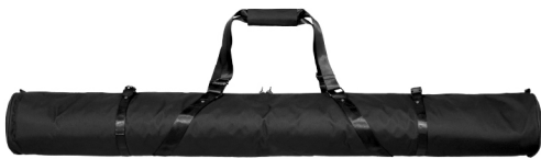
TRIPOD CARRY BAG