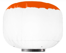
SAFETY BLD-300-G2 NOT INCLUDED