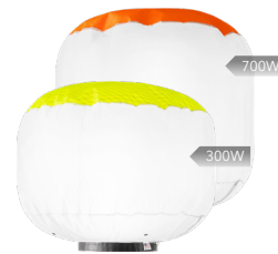
YELLOW & ORANGE