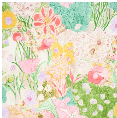
FRANK'S GARDEN Pink & Green 5016421 Wallpaper