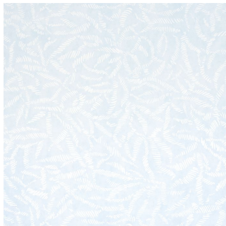
LEAF BLOOM Sky 5016391 Wallpaper