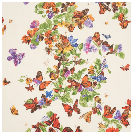
PYNE BUTTERFLY Monarch Orange 5016380 Wallpaper