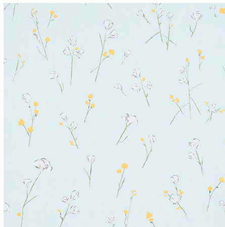
ALEX'S FLORAL Mist Blue 5016401 Wallpaper