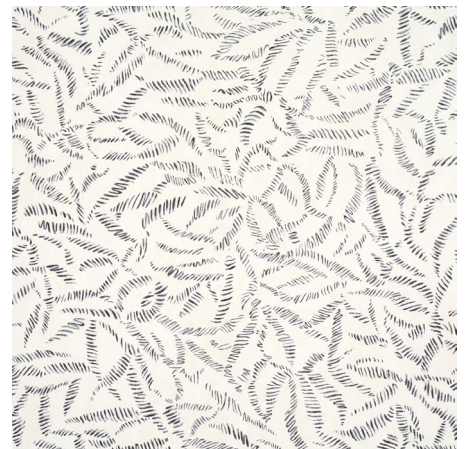
LEAF BLOOM Charcoal 5016390 Wallpaper