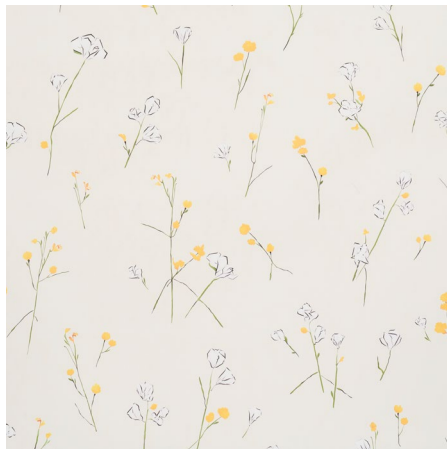
ALEX'S FLORAL Daffodil 5016400 Wallpaper