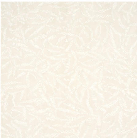
LEAF BLOOM Neutral 5016392 Wallpaper