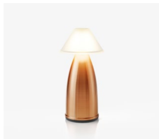
Copper Brushed & Lacquered