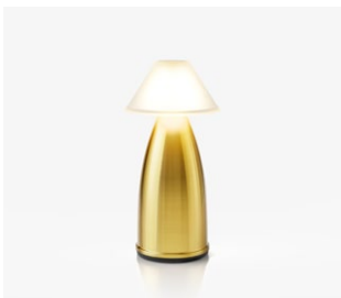
Brass Brushed & Lacquered