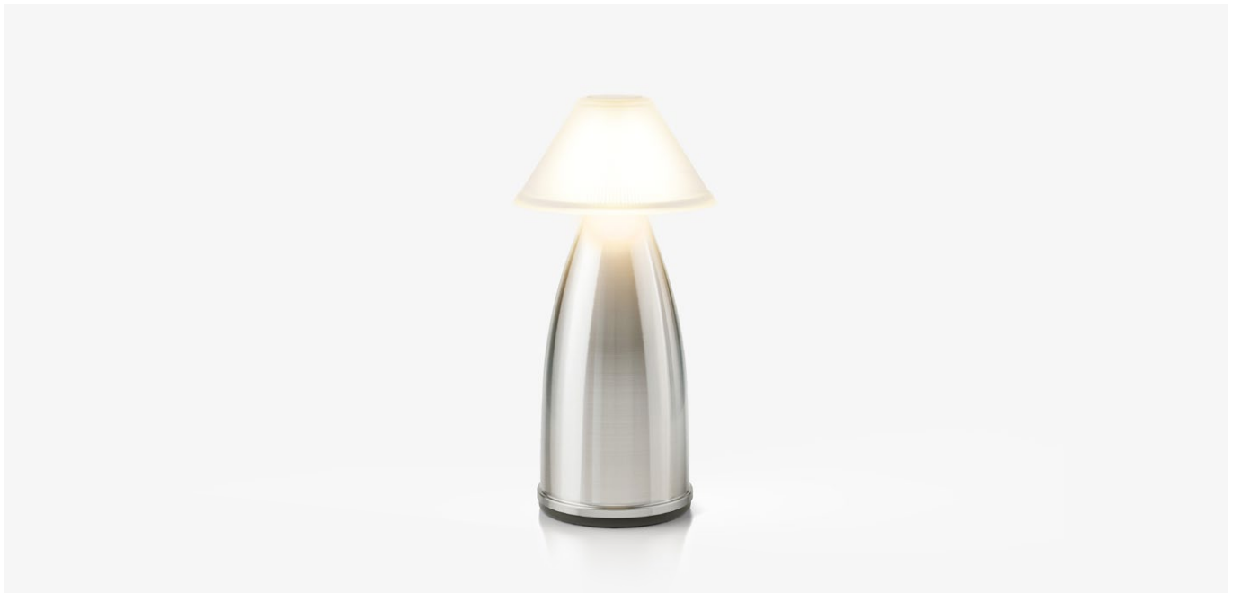
Stainless Steel Brushed