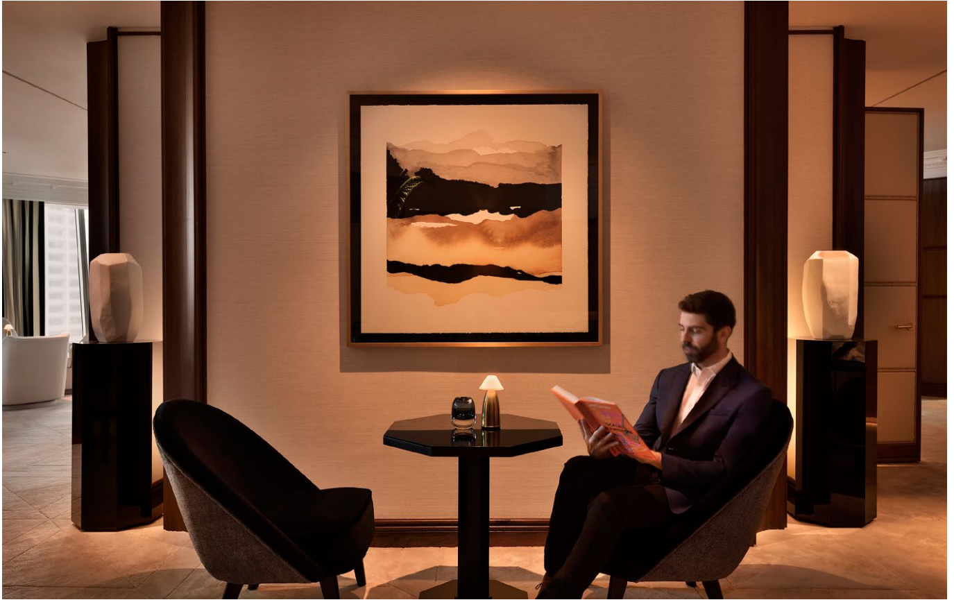
Owl 3 at MARK, Singapore