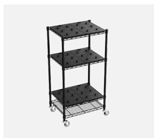
N1 Charging Station (36 lamps)