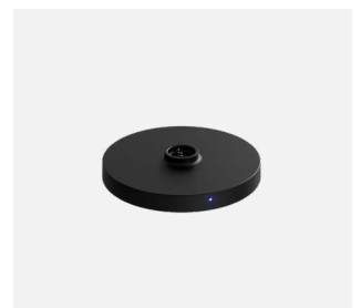
N1 Charging Base (1 lamp)