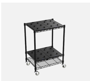
N1 Charging Station (24 lamps)