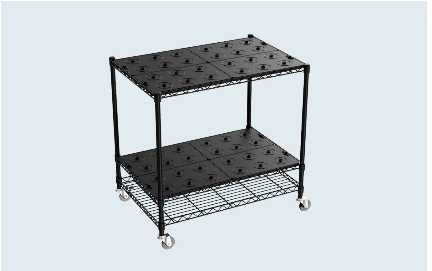
NI Charging Station – 48 Lamps