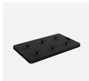
N1 Charging Tray (6 lamps)