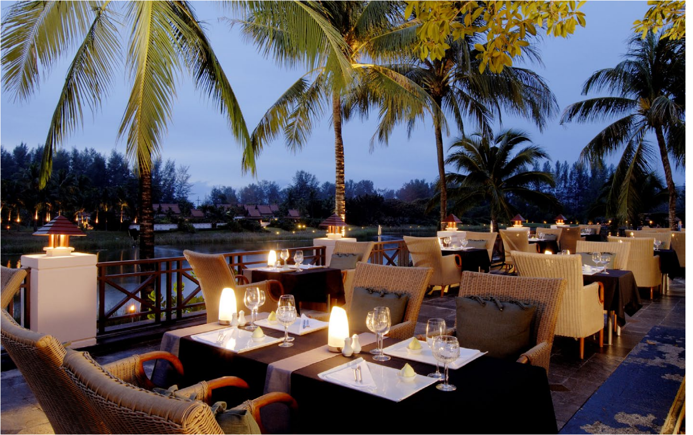
Margarita at Sala Terrace, Banyan Tree Phuket