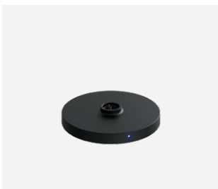
N1 Charging Base (1 lamp)