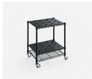
N1 Charging Station (24 lamps)