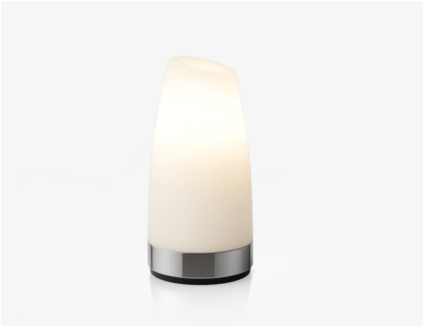
Frosted Hand-Blown Glass with Brushed Stainless Steel Base