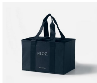
Large Carry Bag (holds up to 6 lamps)