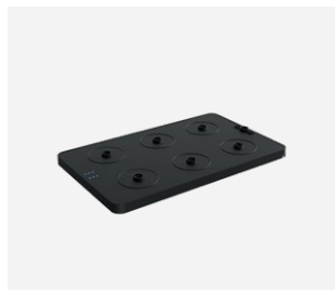
N1 Charging Tray (6 lamps)