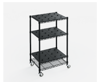
N1 Charging Station (36 lamps)