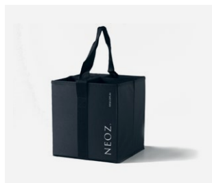
Small Carry Bag (holds up to 4 lamps)