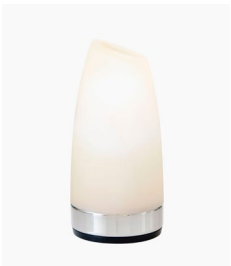
Sand Blasted Hand Blown Glass with Polished Stainless Steel Base