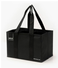
Handling Accessory 6 Lamp Carrier (Optional)

NEOZ Bringing together - Food, People, Places. www.neoz.com