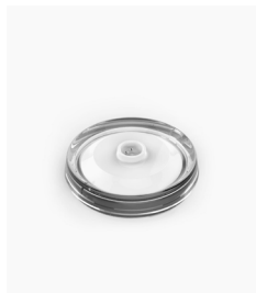
Single Lamp Charger 1 Lamp