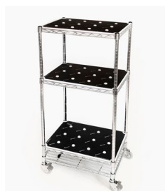
Medium Recharging Station 36 Lamps