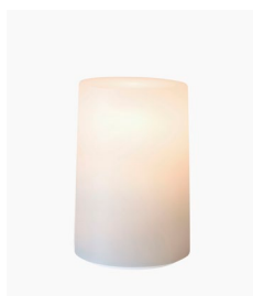
Handmade Resin Opal