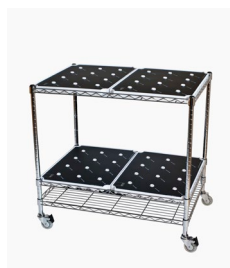
Large Recharging Station 48 Lamps