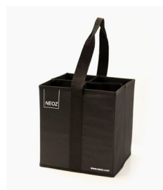
Handing Accessory 4 Lamp Carrier (Optional)