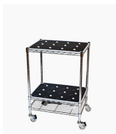
Small Recharging Station 24 Lamps