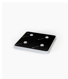
Small Recharging Tray 4 Lamps