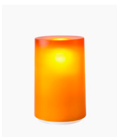
Handmade Resin Amber