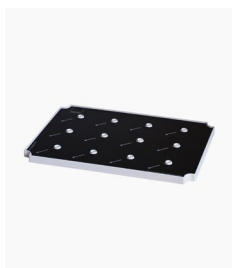
Large Recharging Tray 12 Lamps