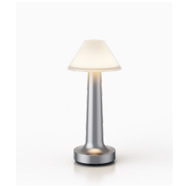
Anodised Silver Aluminium