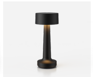
Sandblasted Black Anodised Aluminium