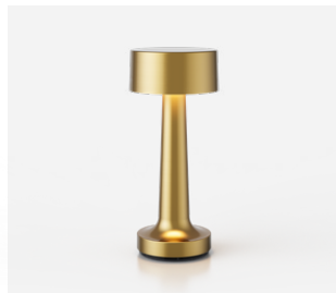
Brass Brushed & Lacquered