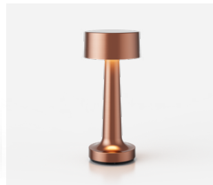
Copper Brushed & Lacquered