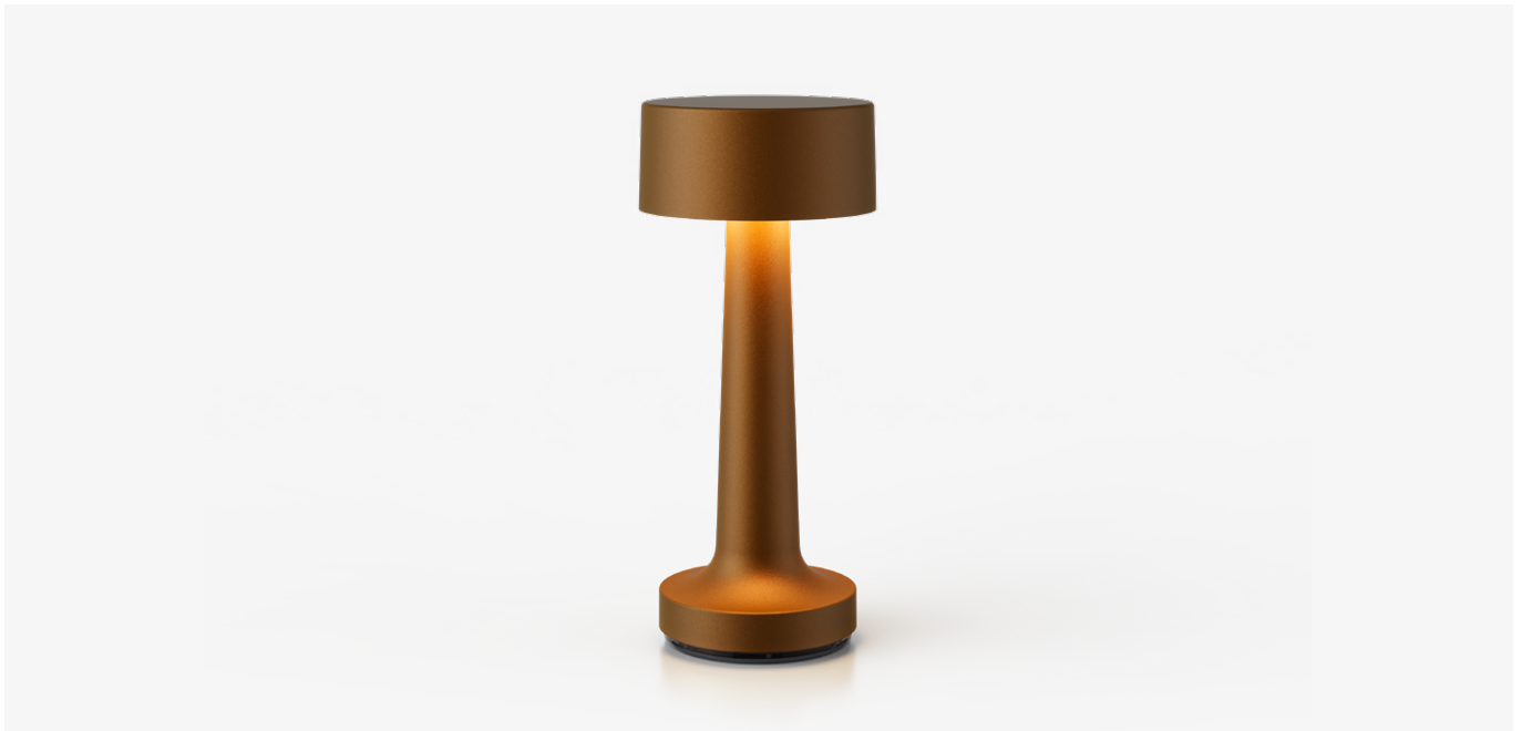
Sandblasted Bronze Anodised Aluminium