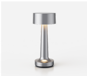
Silver Anodised Aluminium