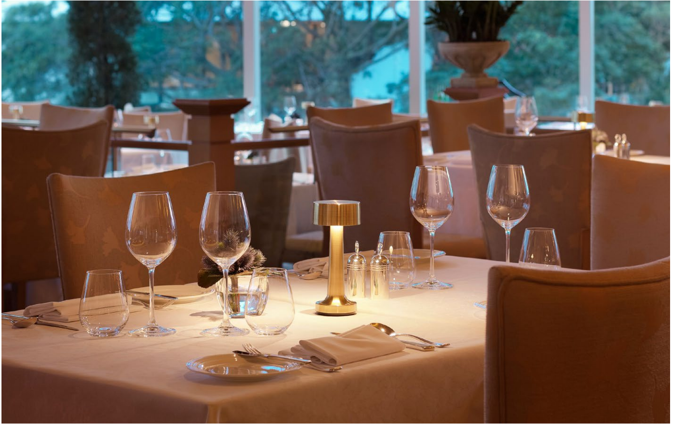
Cooee 2c at Conrad Hotel, Hong Kong