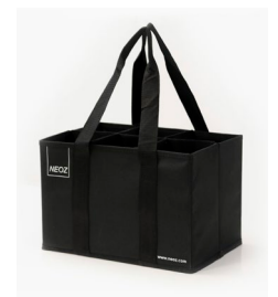
Handling Accessory 6 Lamp Carrier (Optional)

NEOZ The darling of dining tables www.neoz.com