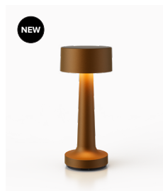
Anodised Sandblasted Bronze Aluminium