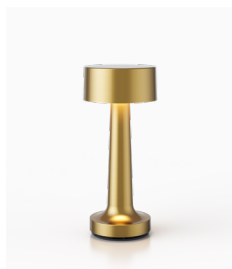
Lacquered Real Brass