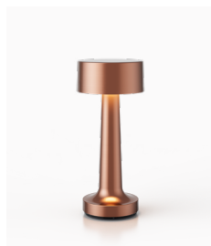
Lacquered Real Copper