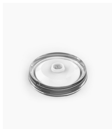
Single Lamp Charger 1 Lamp