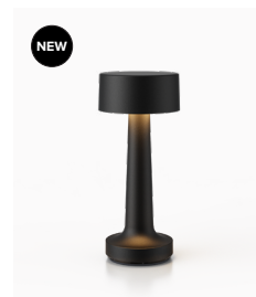
Anodised Sandblasted Black Aluminium