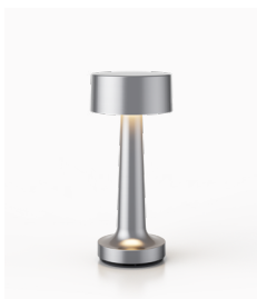
Anodised Silver Aluminium