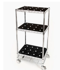
Medium Recharging Station 36 Lamps