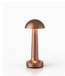
Lacquered Real Copper