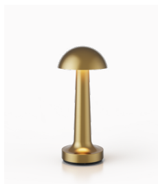
Lacquered Real Brass