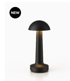
Anodised Sandblasted Black Aluminium