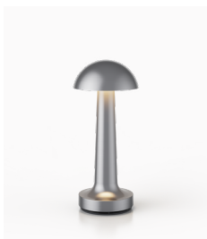
Anodised Silver Aluminium