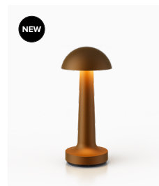
Anodised Sandblasted Bronze Aluminium