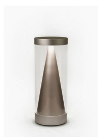
Anodised Silver Aluminium