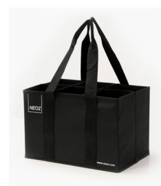
Handling Accessory 6 Lamp Carrier (Optional)

NEOZ Bringing together - Food, People, Places. www.neoz.com