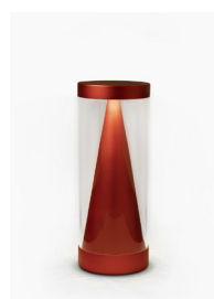
Anodised Fire Red Aluminium