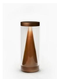
Anodised Mocha Aluminium