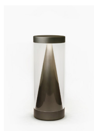
Anodised Shadow Grey Aluminium