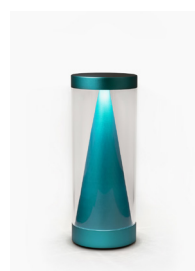
Anodised Barrier Reef Aluminium