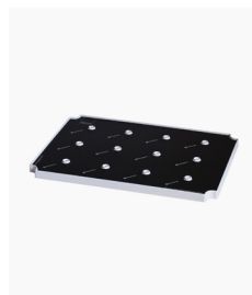
Large Recharging Tray 12 Lamps