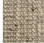
1861220 Terric Grey