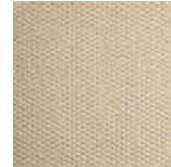
1106110 Quies Ivory

60% NZ, 40% Mediterranean Undyed Wool Pattern: Solid Textured Use: Indoor - Backing: N/A Width: 16'