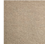
1106120 Quies Beige

60% NZ, 40% Mediterranean Undyed Wool Pattern: Solid Textured Use: Indoor - Backing: N/A Width: 16'