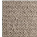
1763610 Ossum Silver

100% New Zealand Wool Pattern: Bouclé Use: Indoor - Backing: N/A Width: 18'