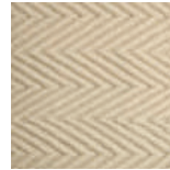
199310 Lanx Ivory