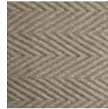
199330 Lanx Grey

Lanx is a celebration of the symmetry of nature, arrestingly beautiful and charmingly simple. Made from New Zealand and Mediterranean wools, Lanx brings depth to the classic creativity from which it was inspired.