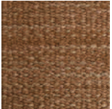
1363510 Ceres Mocha

The interlacing threads mimic the delicate nature of twine, creating a pattern that adds tactile intrigue to your space.