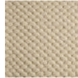
1812510 Acia Ivory

Acia finds its inspiration in the raveled roots, mimicking this web through its intricate cotton overlay. Protectively beneath, lies softly felted 100% undyed New Zealand and Mediterranean wools, reminding us that sometimes there is an abundance of life, just below the surface.