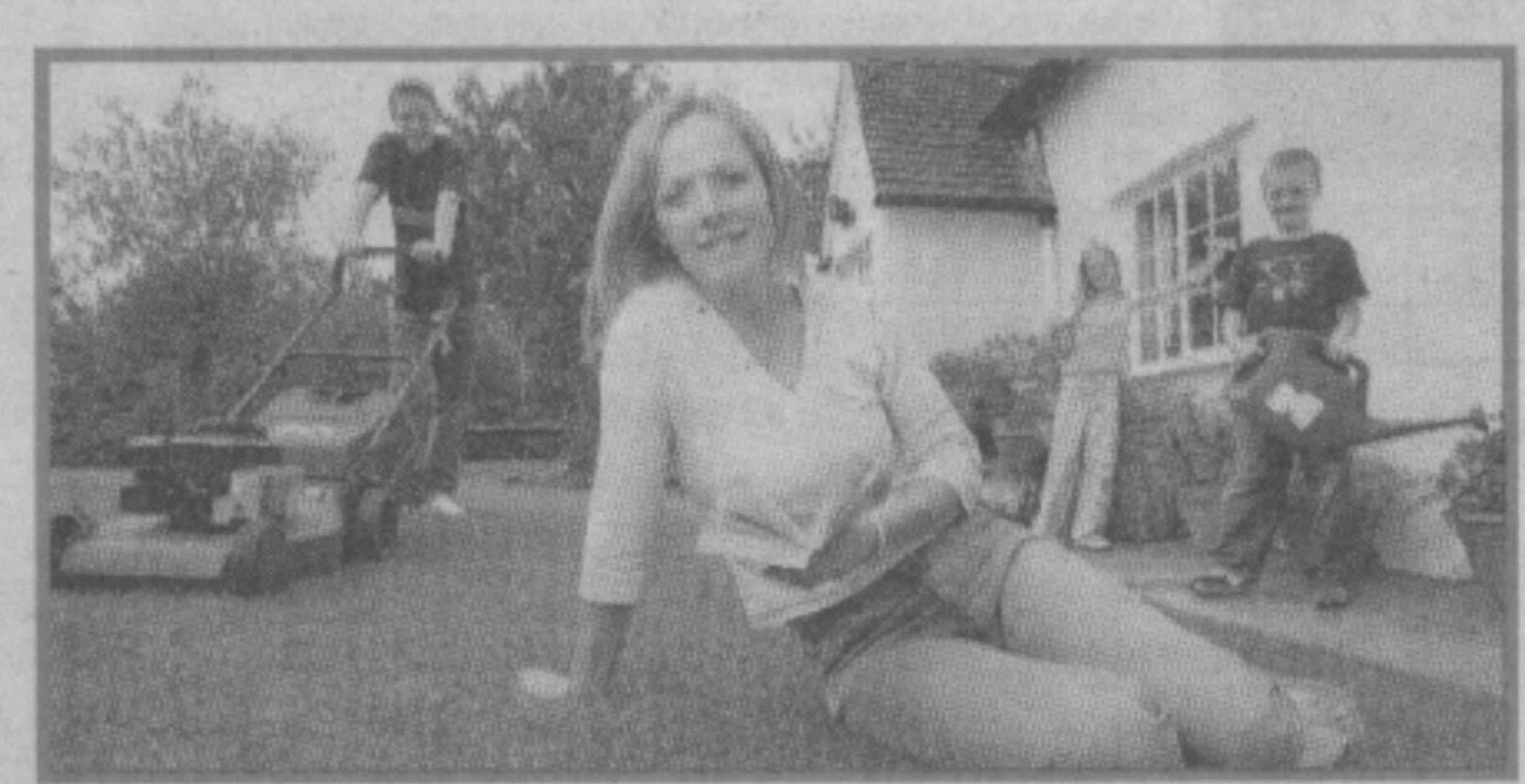
PEACE AT LAST: The family enjoys life in the garden

but he's pleased the kids help me and I have got what I wanted without having to nag, moan and