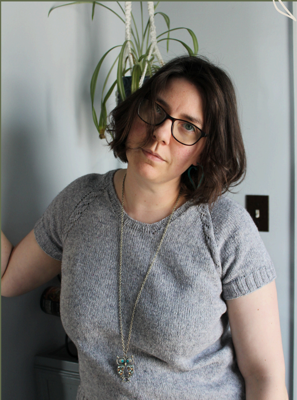
Gillian knit Size D with 1" bust darts