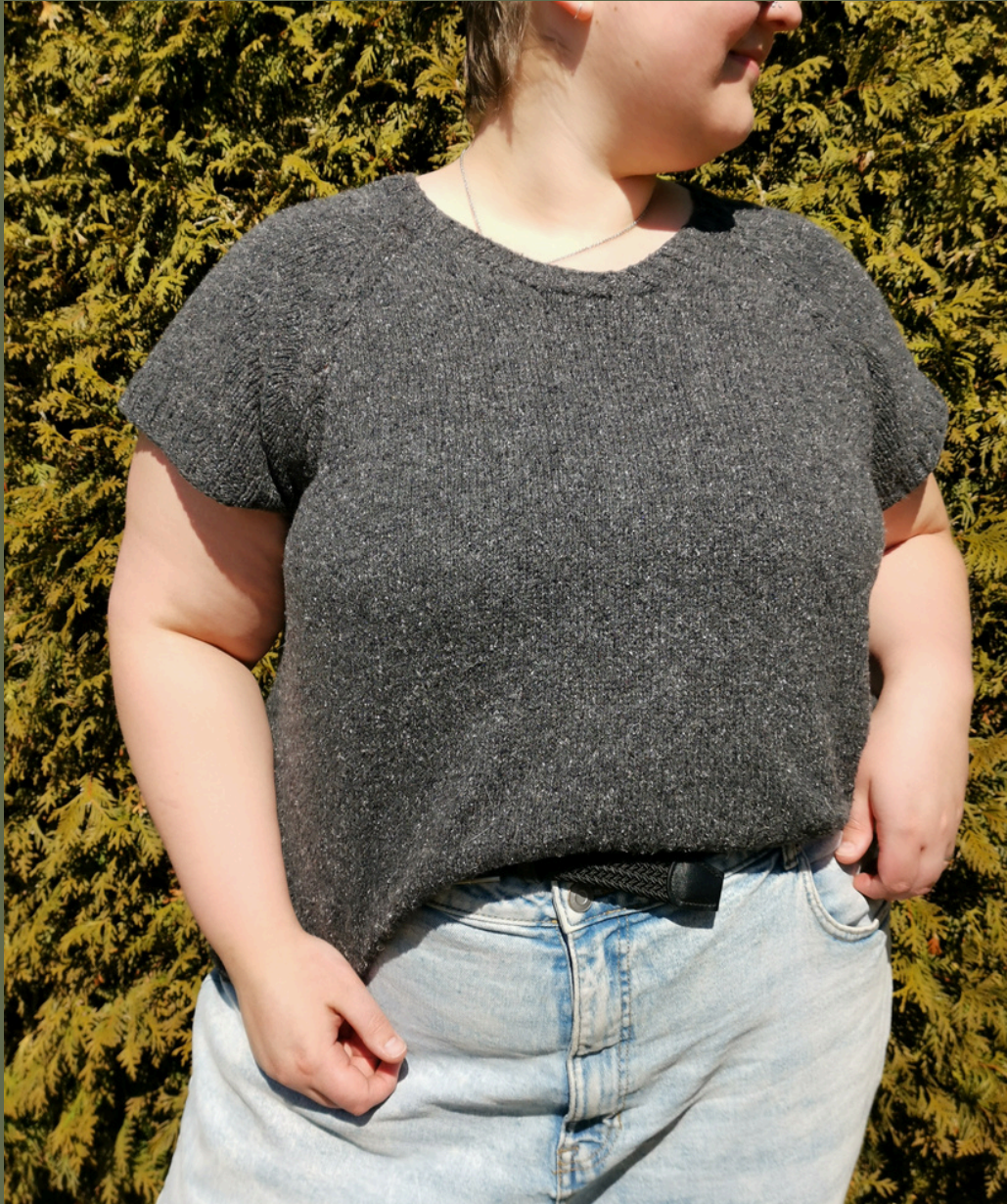
Victoria knit size G with 2" bust darts