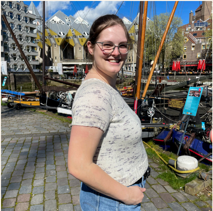
Top: Céline B knit Size D Bottom Left: Symphony knit Size B Bottom Right: Andrea knit Size B