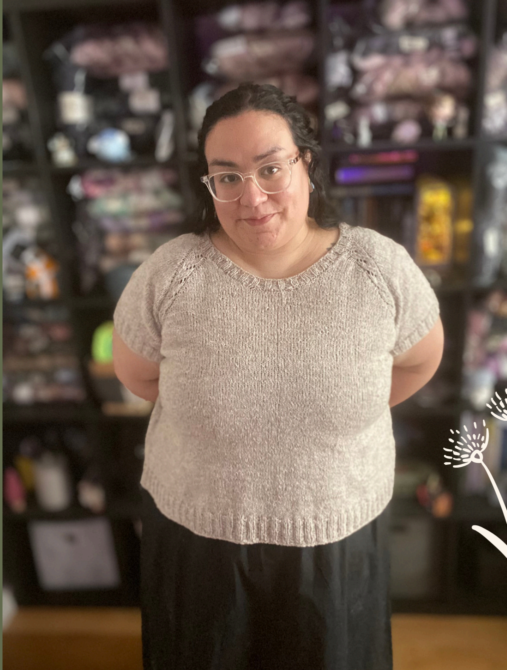
Kirsten knit Size E with 1" bust darts