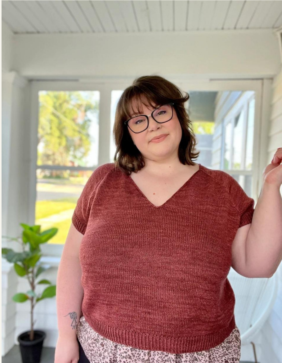
Tara knit size F, with 3" darts.