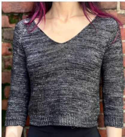
Sylvant knit Size A