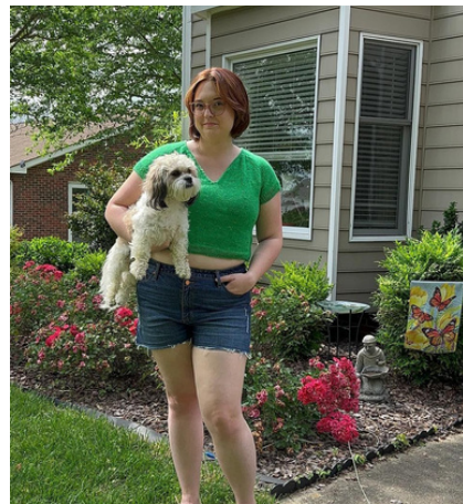
Becca knit Size D with 1" darts