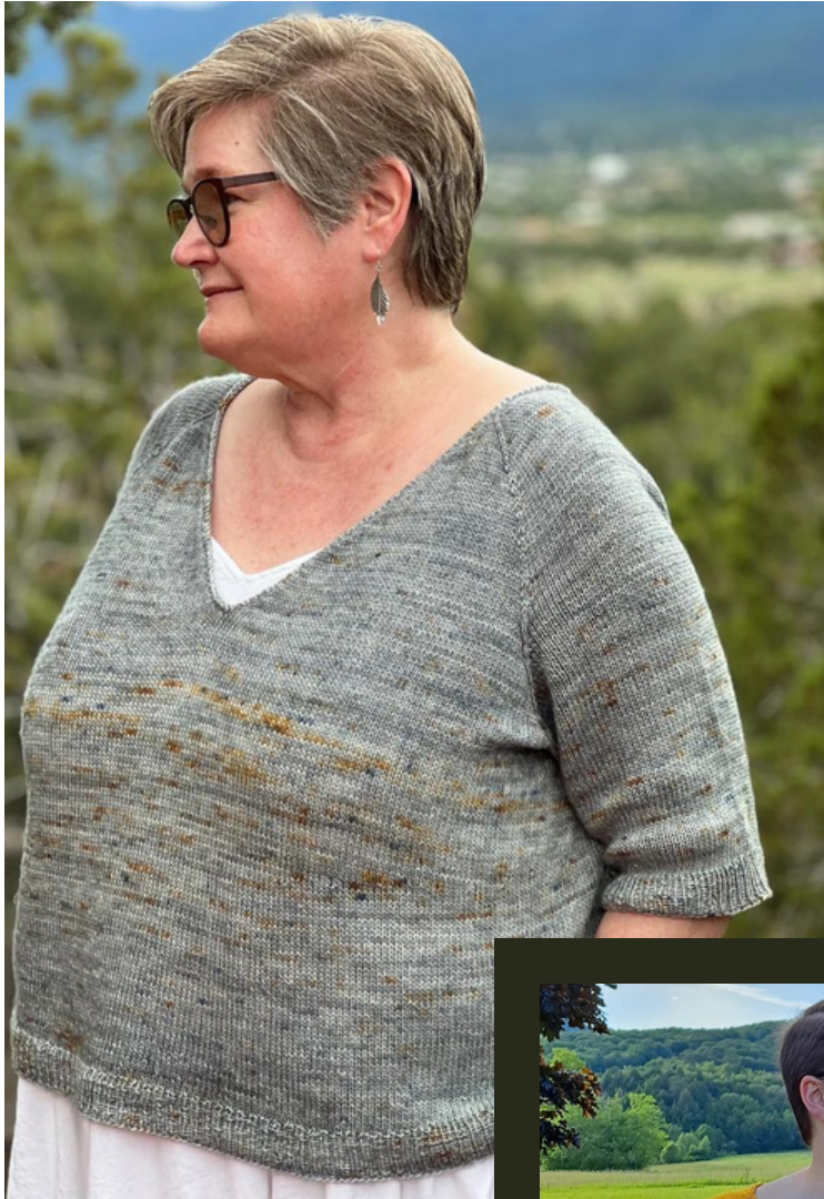
Left: Jen knit Size F with 2" darts