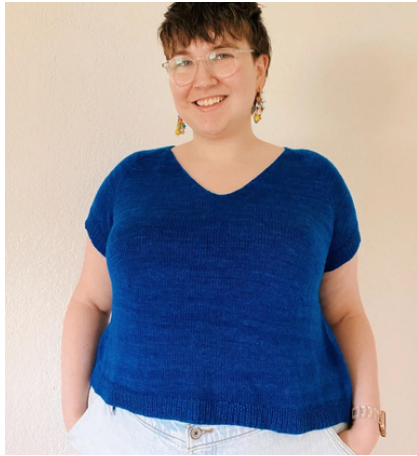
Kaci knit Size E with 3" darts