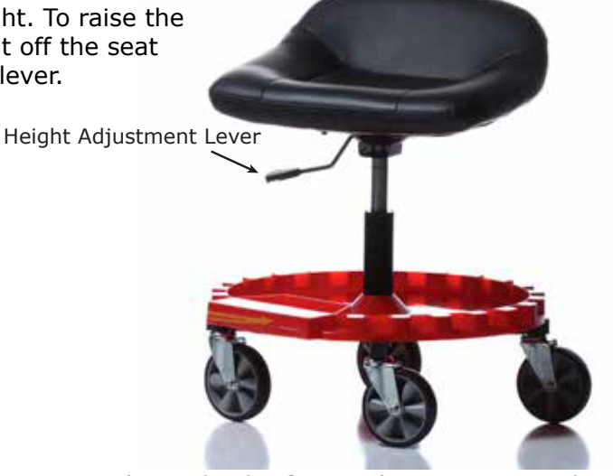
This product has features that are patent pending.

While sitting on the seat pull up on the height adjustment lever to lower the seat height. To raise the seat lift your weight off the seat and pull up on the lever.