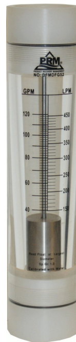
FMDFG52 40-120 GPM 2" FNPT 13.5" tall