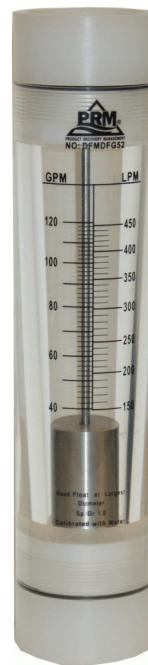
FMDFG52 40-120 GPM 2" FNPT 13.5" tall 3" OD