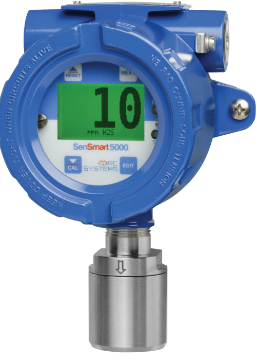
Aluminum "AL" XP model

The State-of-the-art SenSmart 5000 gas detector is RC Systems' newest release to the gas detection industry. No competitive product offers as many features or better performance to cost ratio. With a bright, vivid backlit color display, Modbus and programmable relays, it will satisfy the most demanding application's requirements. The high performance, universal gas detector supports all temperature compensated smart sensor types including Electrochemical, Catalytic Bead, Infrared and Photoionization sensors. It even has Arctic options available for extreme low temperature installations.