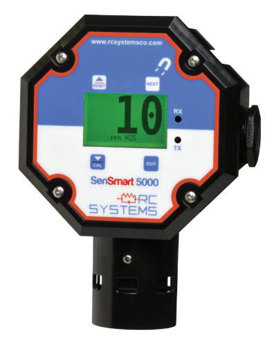
Non-metallic Poly "PY" Div 2 model

The State-of-the-art SenSmart 5000 gas detector is RC Systems' newest release to the gas detection industry. No competitive product offers as many features or better performance to cost ratio. With a bright, vivid backlit color display, Modbus and programmable relays, it will satisfy the most demanding application's requirements. The high performance, universal gas detector supports all temperature compensated smart sensor types including Electrochemical, Catalytic Bead, Infrared and Photoionization sensors. It even has Arctic options available for extreme low temperature installations.