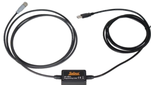
USB-A Programming Cable