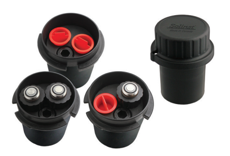
Levelogger 2" Locking Well Cap Installations (see Well Caps data sheet for more details)

The cap is vented to equalize atmospheric pressure in the well. It slips over the casing, and can be secured using a lock with a 9.5 mm (3/8'') shackle diameter.