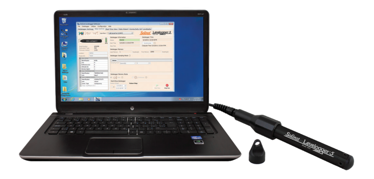
Fast communication and downloading speeds with a high speed Field Reader 5

The Levelogger 5 uses a Faraday cage design, which protects against power surges or electrical spikes caused by lightning. Its durable maintenance-free design, high accuracy and stability, make the Levelogger 5 the most reliable instrument for long-term, continuous water level recording.