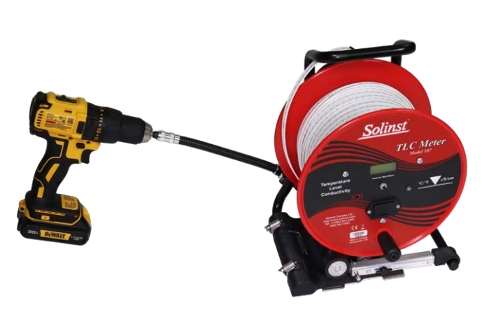
Solinst TLC Meter with Power Winder Installed to Make Temperature and Conductivity Profiling Applications Easier