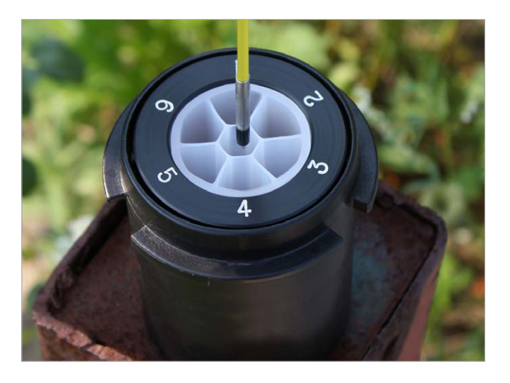
Measure water levels within the narrow channels of a Solinst CMT® System.

The 102M Mini Water Level Meter is available in 25 m and 80 ft lengths. There is the choice of the P4 or P10 Probe.