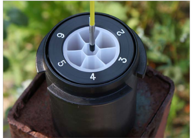
Measure water levels within the narrow channels of a Solinst CMT® System.

The 102M Mini Water Level Meter is available in 25 m and 80 ft lengths. There is the choice of the P4 or P10 Probe.