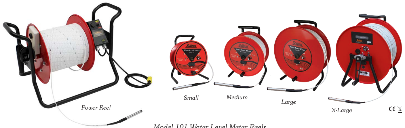
Model 101 Water Level Meter Reels