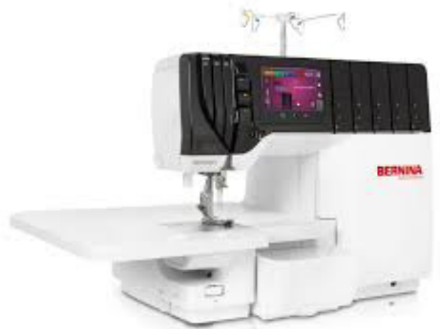
Airthreading - $130

Includes overlocker or coverstitch only and combi models