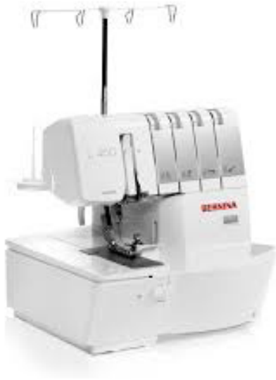
Overlockers/ Coverstitch - $110

Includes overlocker or coverstitch only and combi models