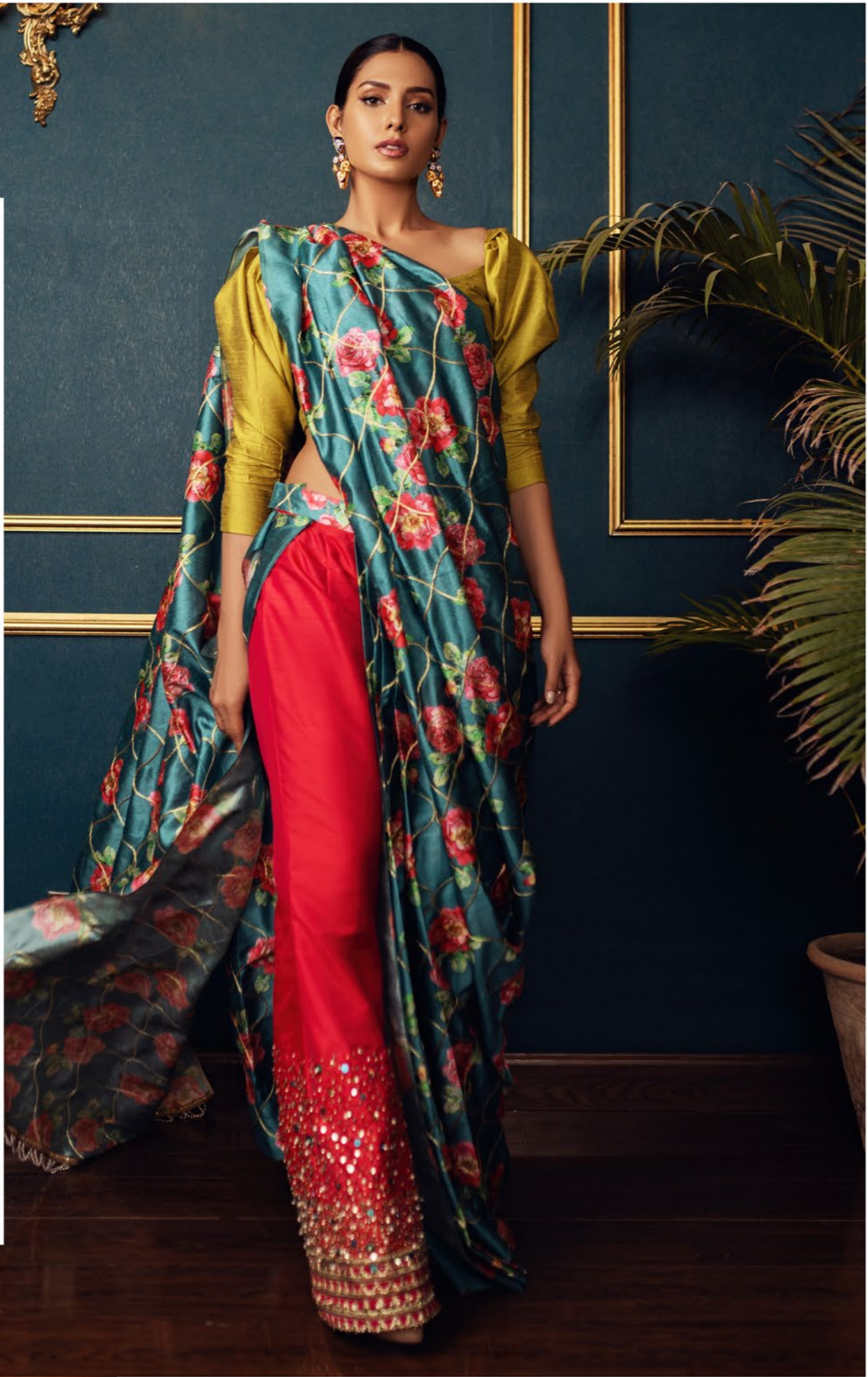
Saree with Pants PKR 85,000