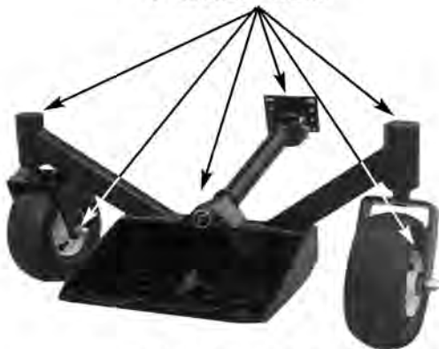
SW2000 / SW2002