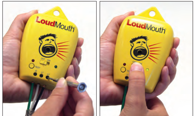
Connect the leads to the LoudMouth.