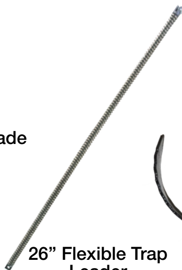
26" Flexible Trap Leader