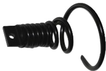
Large Retrieving Tool