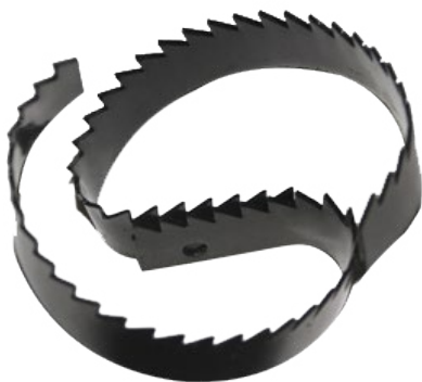
4" Rotary Saw