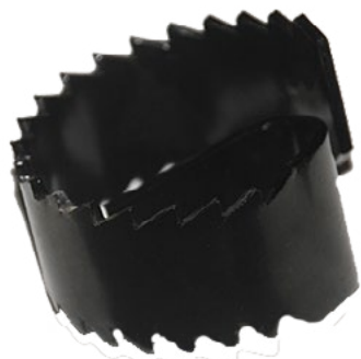
3" Heavy Duty Saw Blade