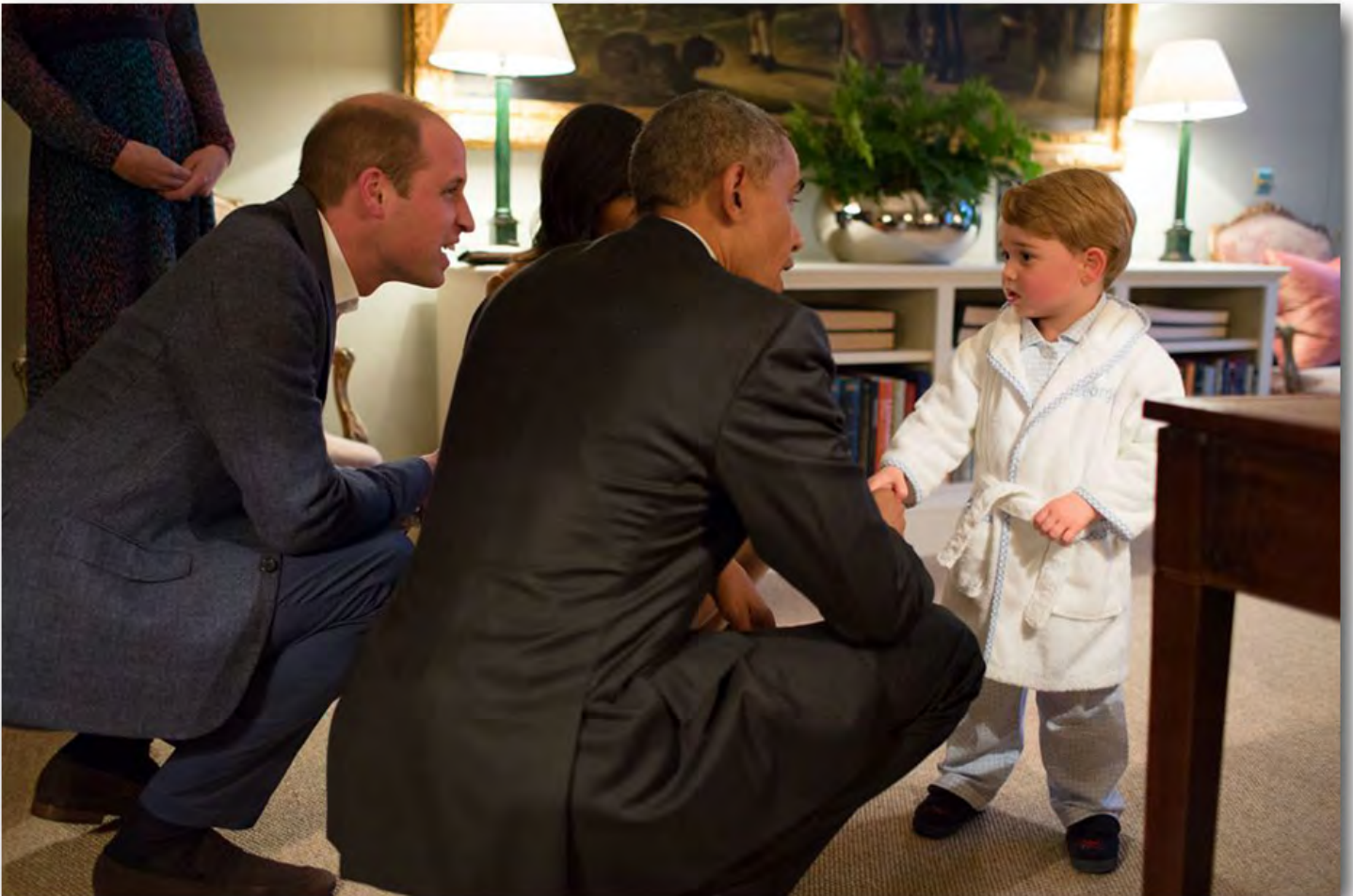
..... Prince George of Cambridge wearing Petite Plume while meeting President Obama.

Made with the finest quality cotton, the soft, breathable fabric is brushed for added softness and gets cozier with each wash. In Petite Plume sleepwear, you'll be tucked in love and off to Dreamland. Bonne Nuit, ma petite plume.