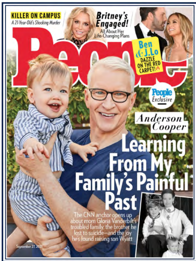
September 2021 Issue