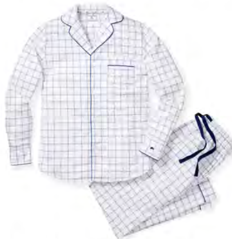
Petite Plume Nantucket Tattersall Pajamas

"The Best Men's Pajamas Double As Obscenely Comfy Daywear"