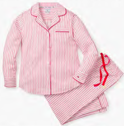
Petite Plume red ticking stripe pajama set

"The 25 Best Pajamas to Dress Up Your Beauty Rest"