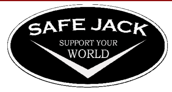
PN: 97105 Model Number: 97M-UBB PN Instruction : 97001