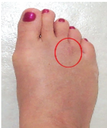
Area where Morton's Neuroma occurs