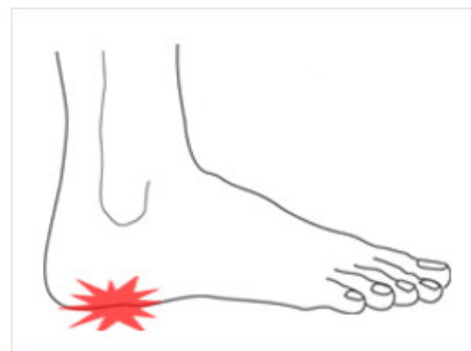
Image of where heel spur pain may occur