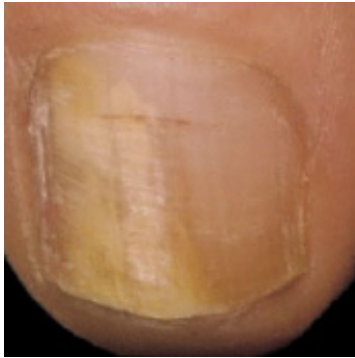
Fungal Nail Infection