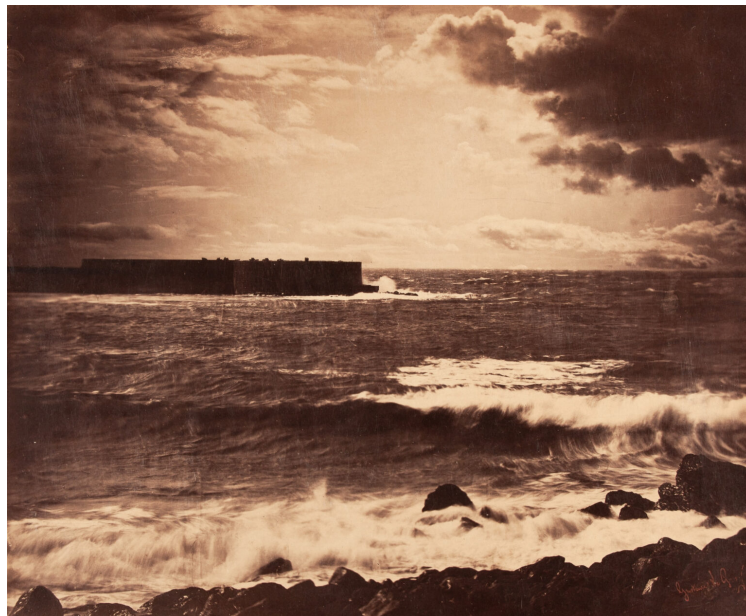
Gustave Le Gray

For 200,000 euros he is presenting at Photo Discovery one of the icons of photography from the early days of the discipline, a Grande Vague