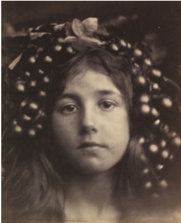
Julia Margareth Cameron .