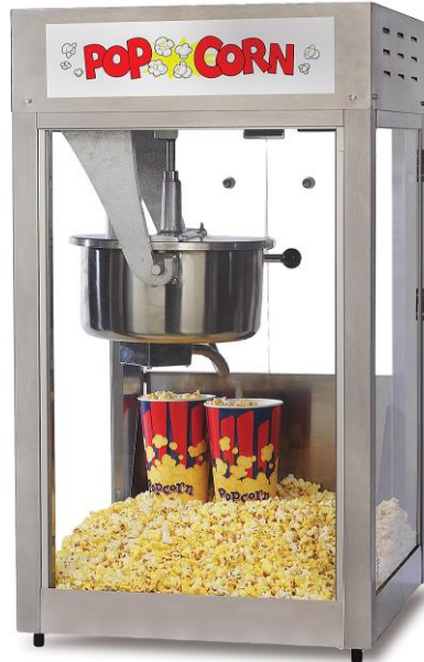
General image shown for reference.