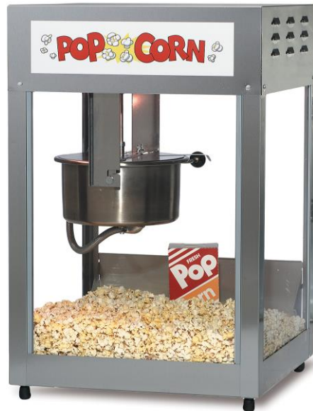
General image shown for reference.