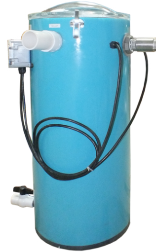
Rear view (Arrival of the main lines)