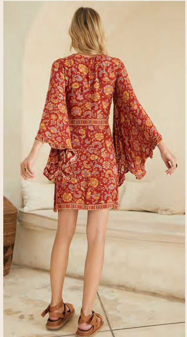
MOONDANCE MINI DRESS IN GARNET 100% LENZING ECOVERO VISCOSE