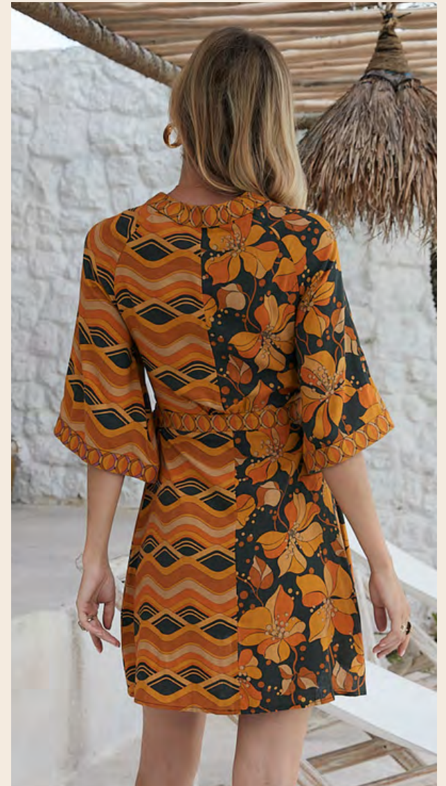
KIKI WRAP MINI DRESS IN SPICE 85% VISCOSE 15% LINEN