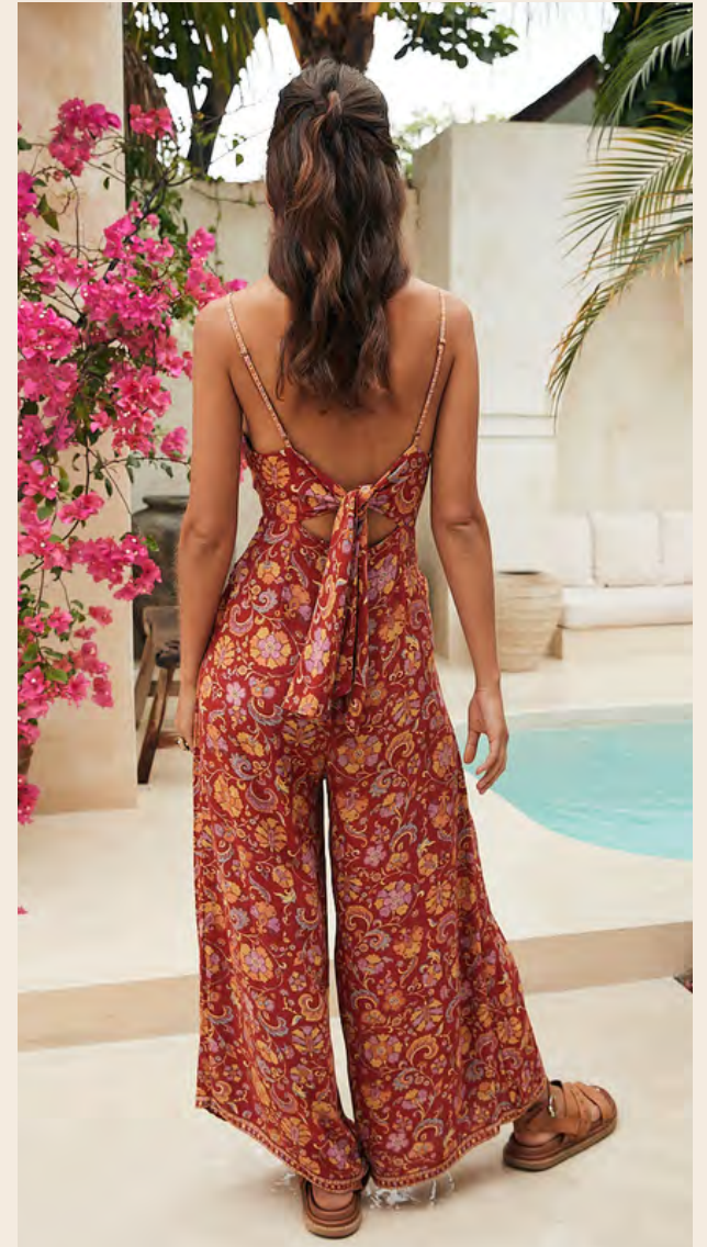
JONES JUMPSUIT IN GARNET 100% ECOVERO VISCOSE CREPE