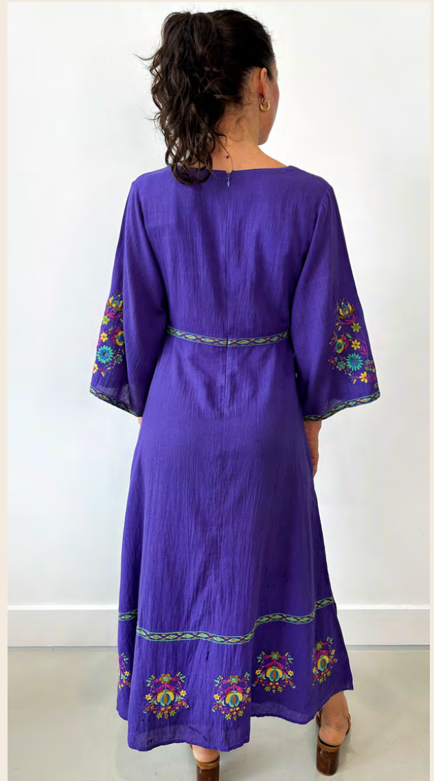
EMBROIDERED EMPIRE DRESS IN MAJESTY 100% COTTON