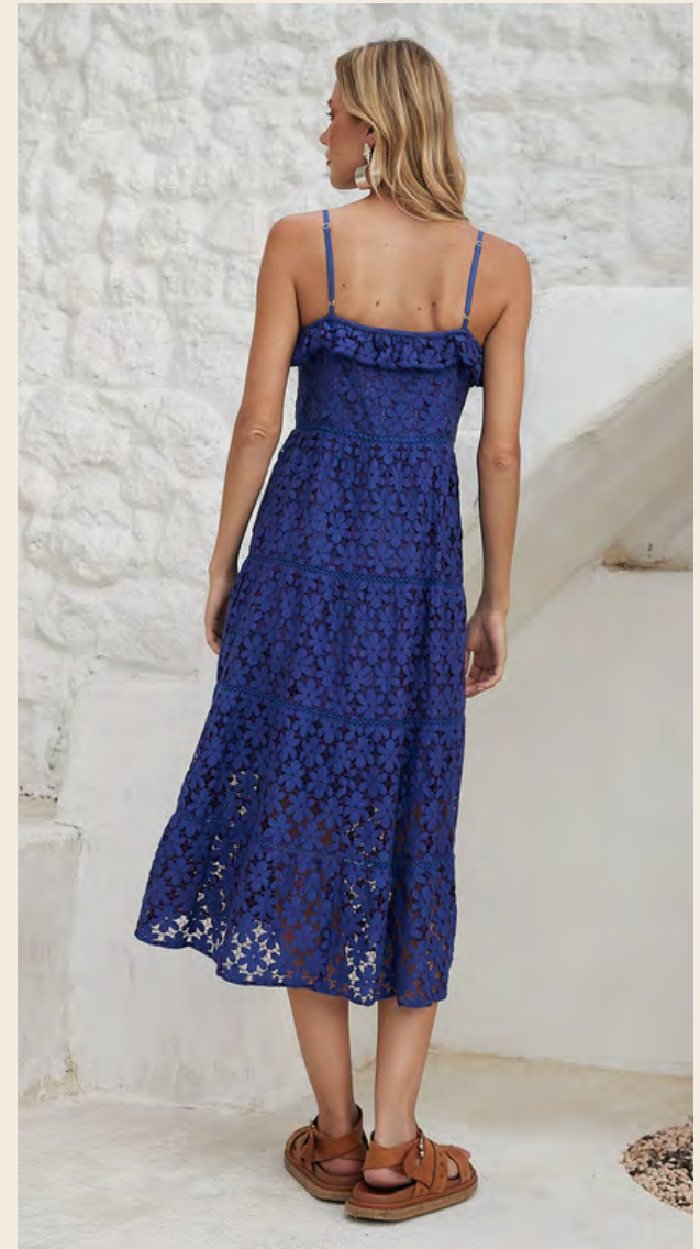
FLORENTINA MIDI DRESS IN INDIGO 100% COTTON