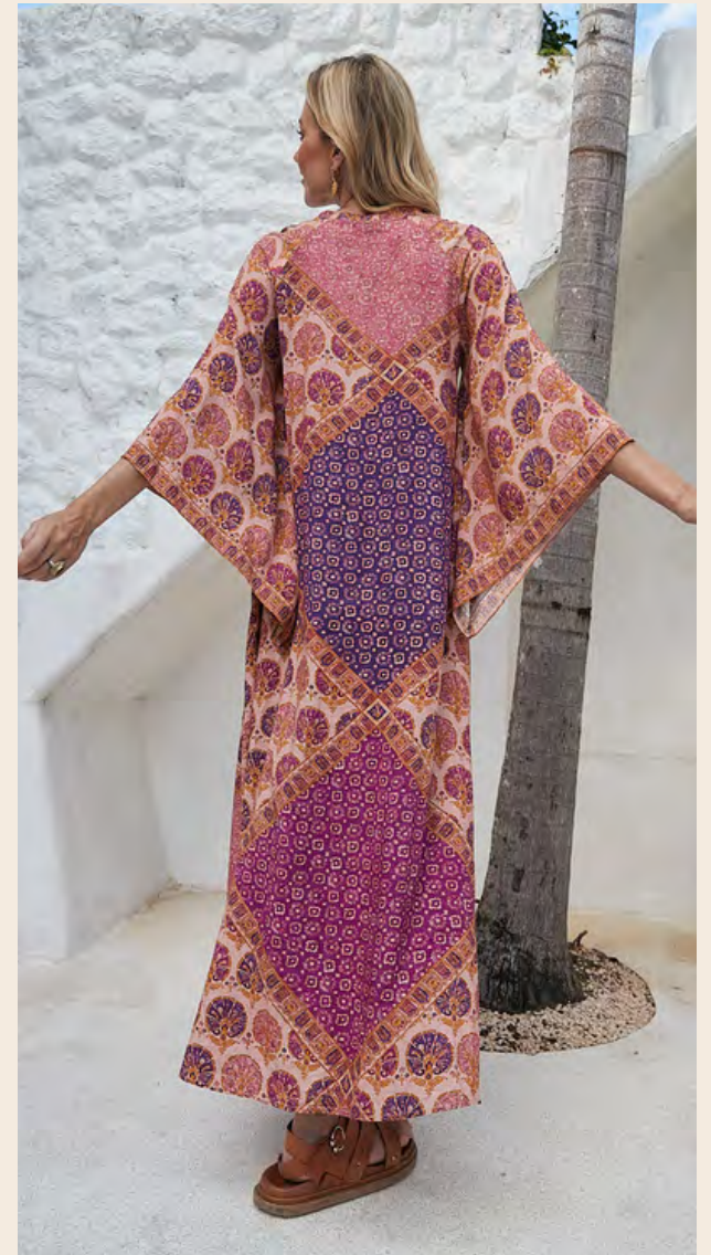
DREAMWEAVER GOWN IN ANTIQUE ROSE TEXTURED ECOVERO VISCOSE CREPE