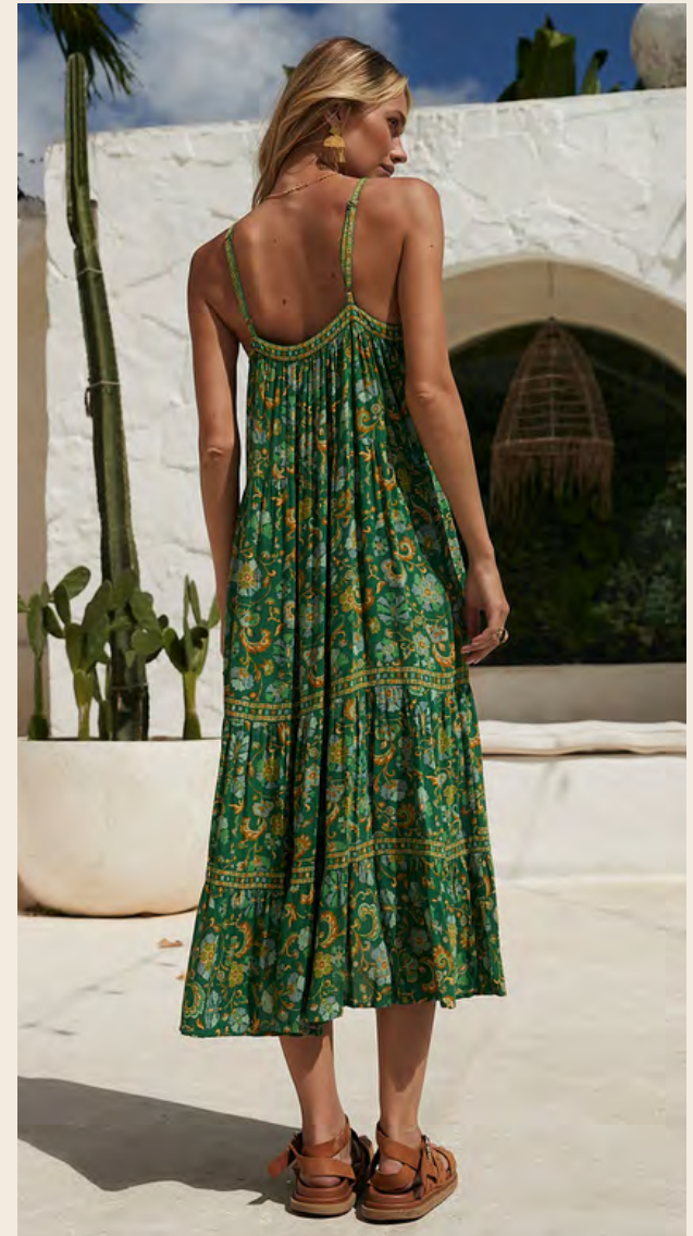
AVRIL STRAPPY DRESS IN CYPRESS 100% ECOVERO VISCOSE CREPE