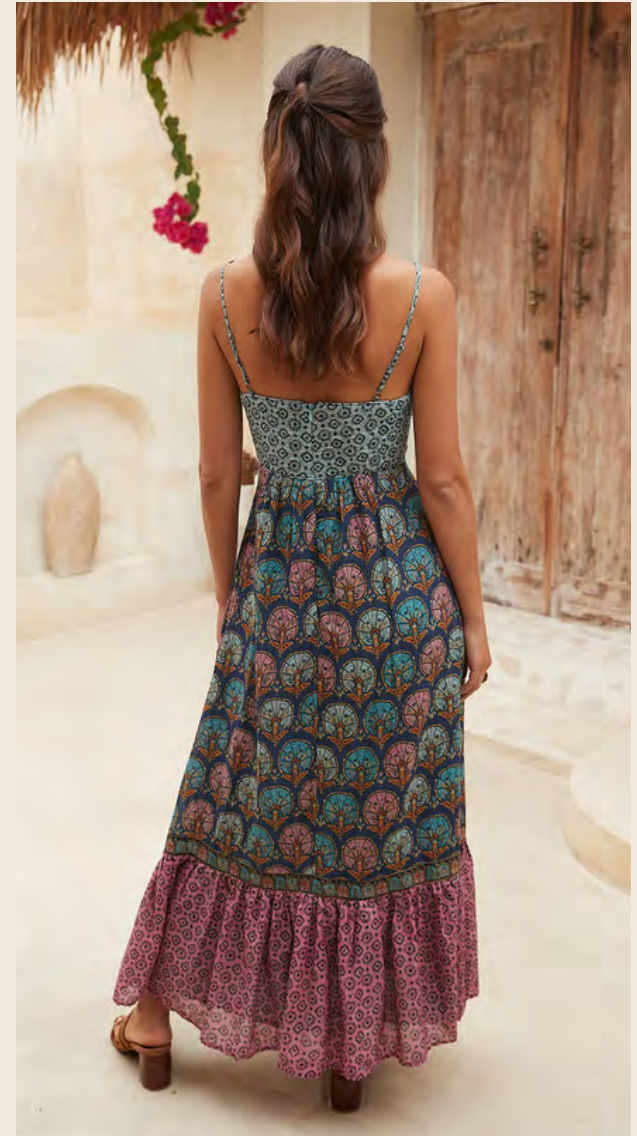
OPHELIA DRESS IN PERSIAN JEWEL 100% COTTON VOILE