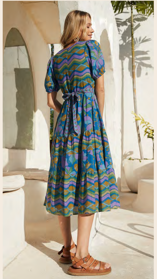
LOVER MIDI DRESS IN PACIFIC 100% COTTON VOILE