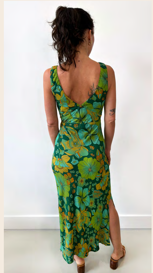
SARAH BIAS MIDI DRESS IN EMERALD 100% LENZING ECOVERO VISCOSE