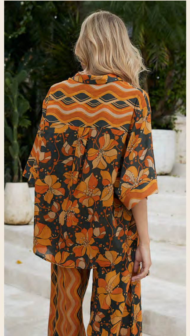
LOIS SHIRT IN SPICE 100% COTTON VOILE