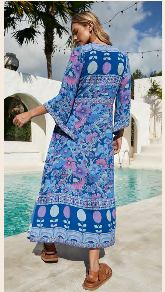
EMPIRE DRESS IN LAPIS 100% LENZING ECOVERO VISCOSE