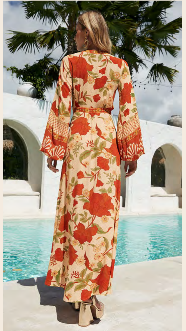
ALLURE WRAP MAXI DRESS IN ROSE 100% LENZING ECOVERO VISCOSE