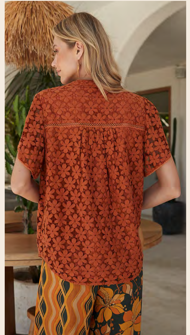
ROSA LACE BLOUSE IN GINGER 100% COTTON