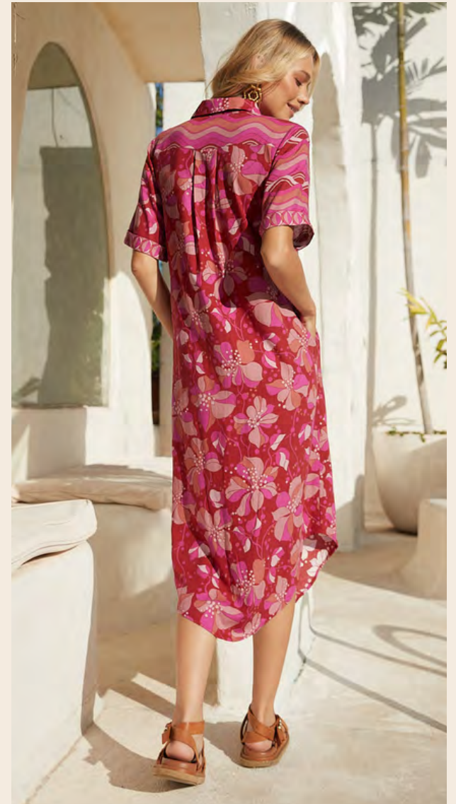
SIENNA SHIRT DRESS IN FUSCHIA 85% VISCOSE 15% LINEN