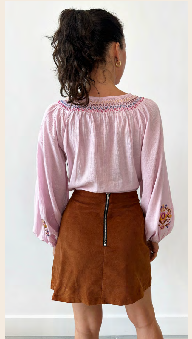
ZIGGY MINI SKIRT IN TAN 100% COTTON (CORDUROY)