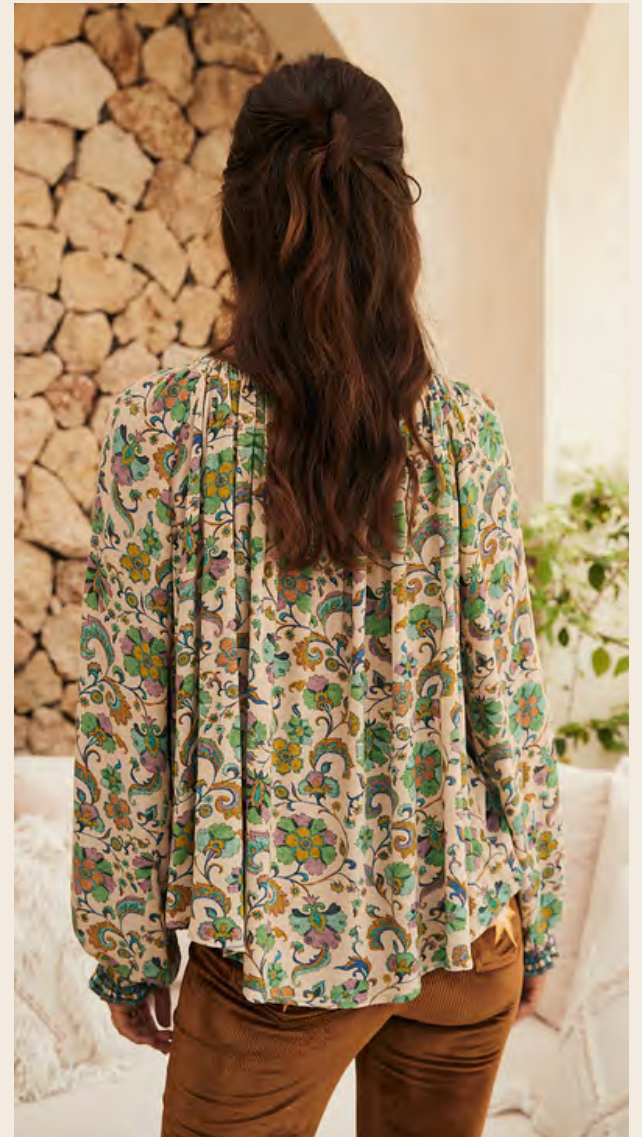
SCARLETT BLOUSE IN MAGNOLIA 100% ECOVERO VISCOSE CREPE