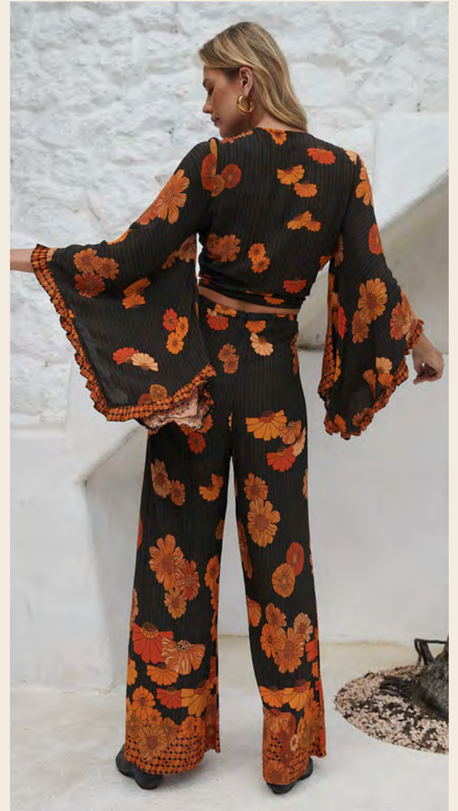
LITTLE WING TOP IN MIDNIGHT 100% LENZING ECOVERO VISCOSE