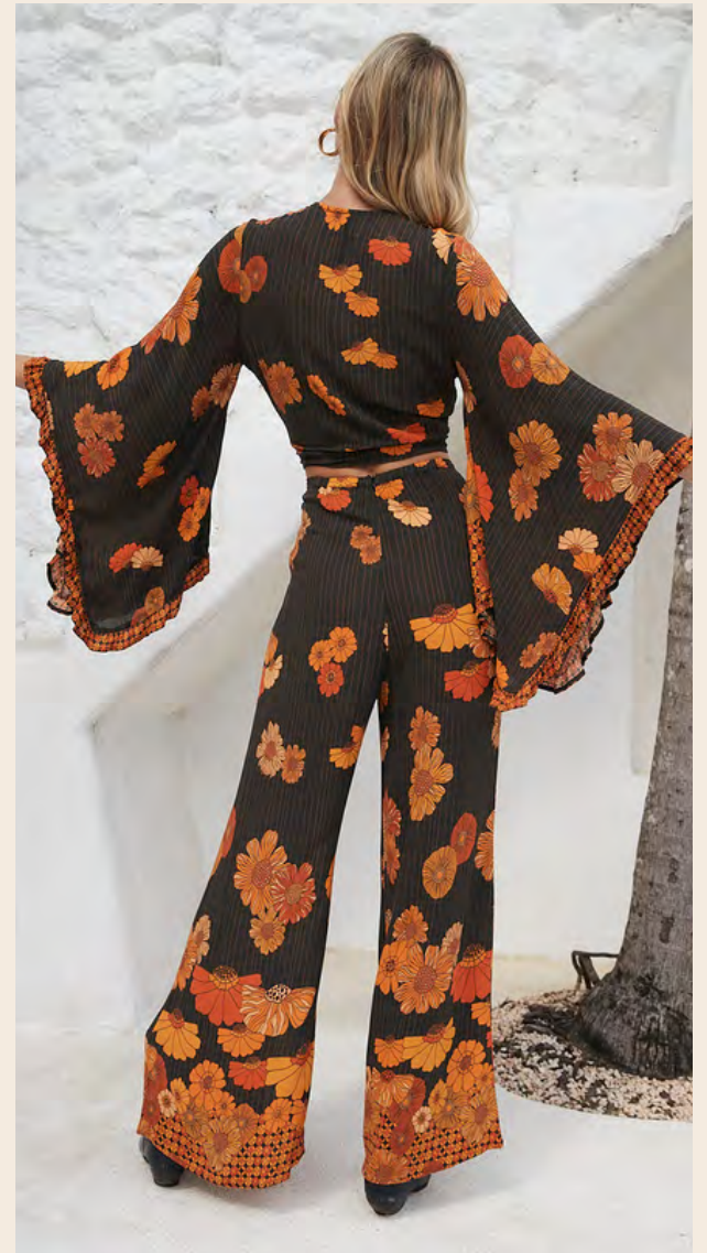
PALAZZO PANT IN MIDNIGHT 100% LENZING ECOVERO VISCOSE