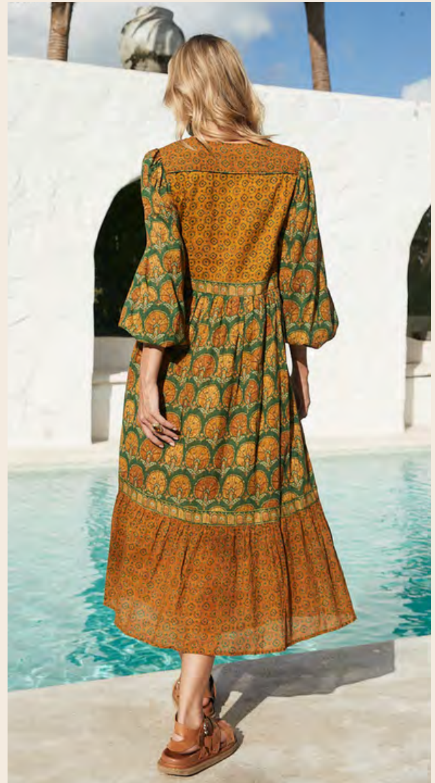
STEVIE MIDI DRESS IN WILLOW 100% COTTON VOILE