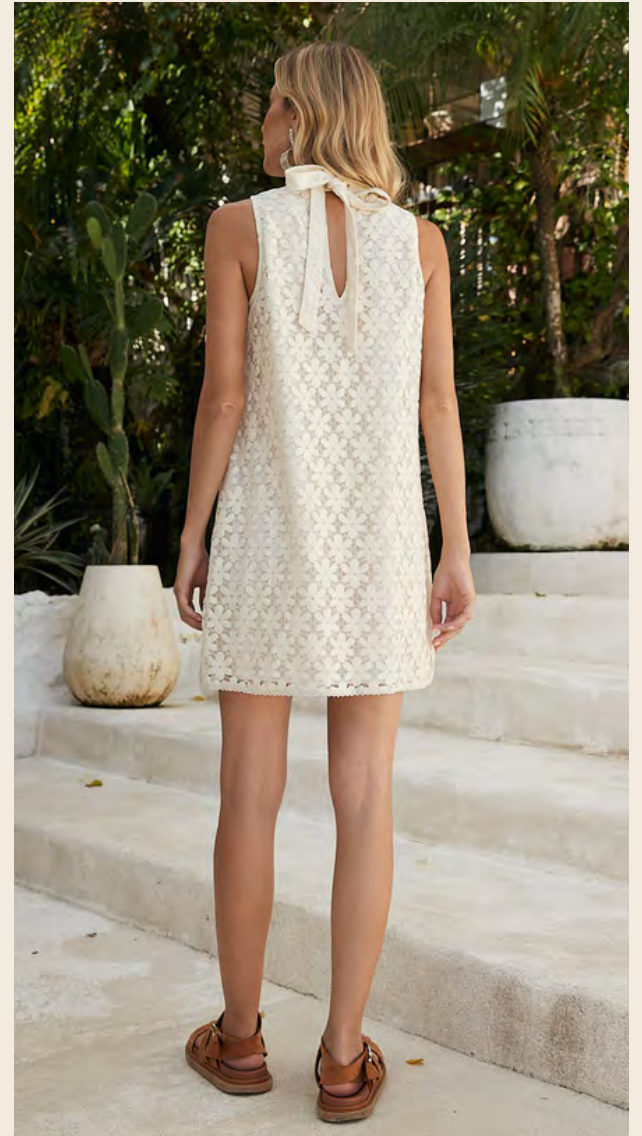
TWIGGY LACE MINI DRESS IN PEARL 100% COTTON