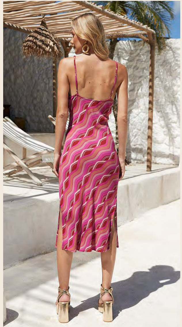
SHIMMY BIAS MIDI DRESS IN FUSCHIA 100% LENZING ECOVERO VISCOSE