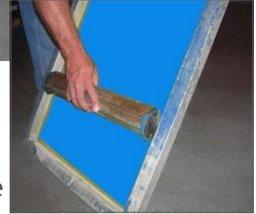
Step 2. Squeegee Side