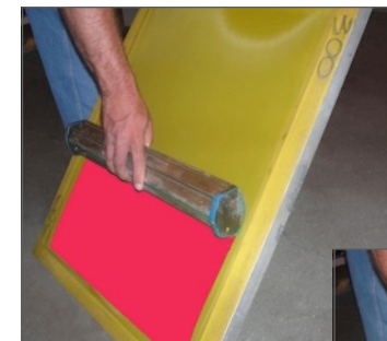
Step 1. Print Side

Note: Above times are based on using a screen coated 2/2.