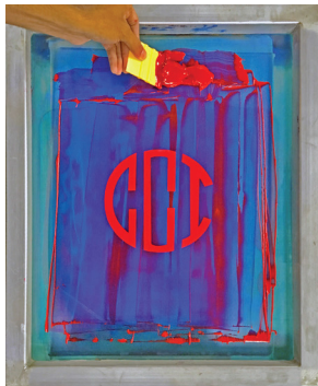
Step 1. Card excess ink from screen