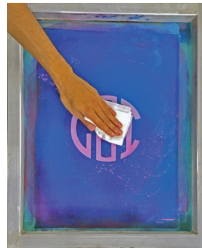
Step 3. Wipe away remaining residue with paper towel