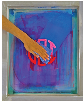
Step 2. Apply envirowipes to both side of screen