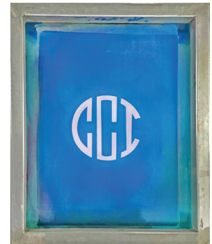
Step 4. End Result