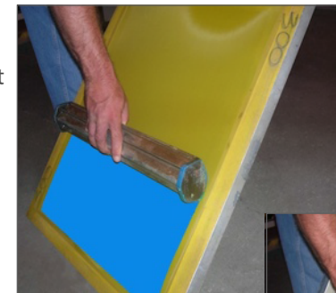
Step 1. Print Side

Note: Above times are based on using a 5KW Metal Halide Lamp.